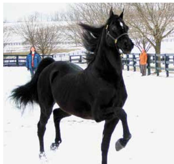
In retirement, And The Beat Goes On loved to show off for anyone who came to Dragonsmeade Farm as he did on this snowy Kentucky day during the 2010 AMHA Convention.