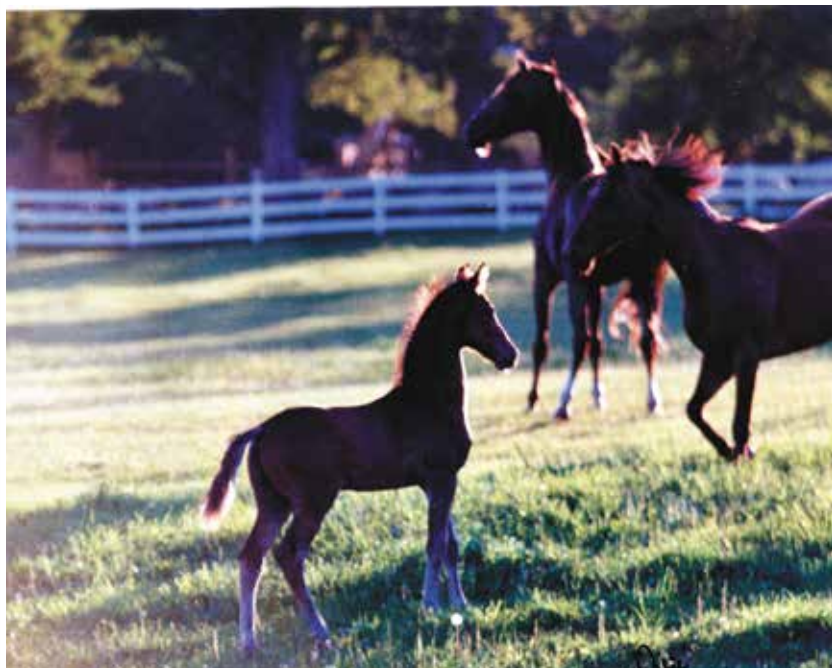
Bred, foaled and raised at Salem Farm in Vermont, Bada Bing was a standout in the pasture before he ever began his formal training.