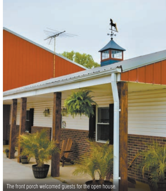
The front porch welcomed guests for the open house.