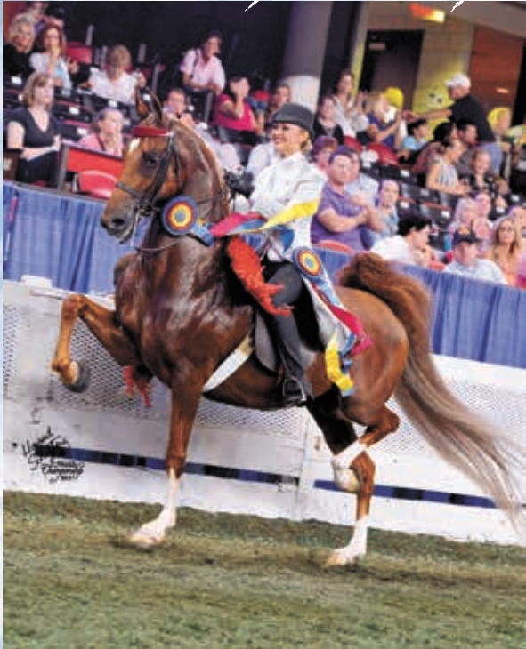
In Chancellor's final junior exhibitor season, the team moved to the park division pursuing the coveted blanket of roses. They had an incredible last season together making that dream come true with wins also at Midwest, Asheville, Bridlespur and Kansas City.