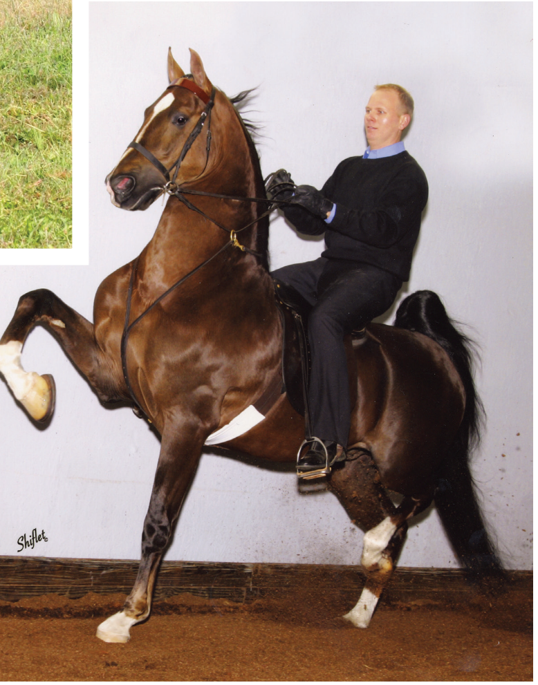
Woodleigh Farm LLC is the proud owner of Undulata's Nutcracker who is one of many top sires that stands at the Kentucky based Willowbank Farm.

"I just feel lucky to be part of his life," she said. "He is one of a kind. I don't think there will be another one like him. There hasn't been another one like him."