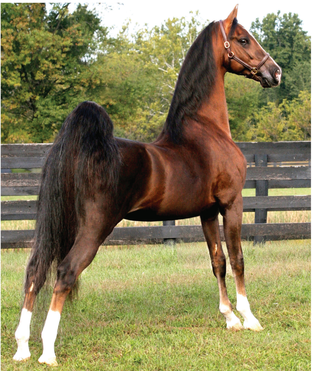
Undulata's Nutcracker has enjoyed great success and dominance in the breed as a sire. He has been linked to a myriad of top campaigners, with many bearing "nut" show names.

After he breeds, it takes a lot to get him there, but he breeds and when he's done, you can hand him to someone who is just learning to walk a horse and he will walk gently with them. He loves watermelon. He will give anything for watermelon. I am not there a whole lot because I don't live down there but if he sees me coming, he starts neighing and having a fit because he knows that I probably have a watermelon for him. He is a very unique guy."