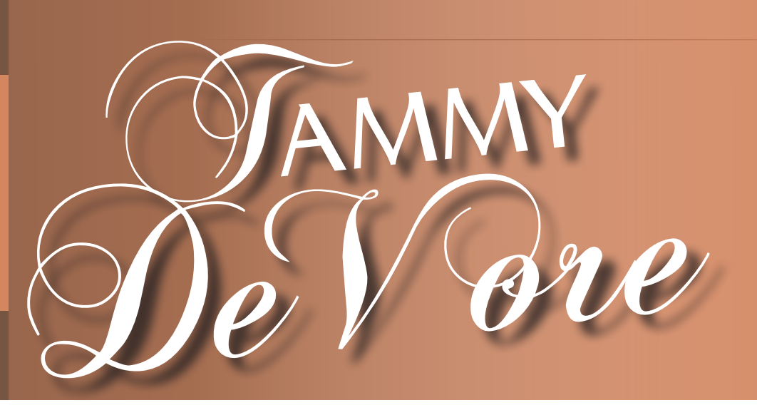
By Erica Faulkner

hallenges have a way of changing you. They can spur you to try harder, or frustrate you until you give up and back down. Obstacles will arise for everyone, at some point in life. How these are handled and how you let them affect you, can determine who you are as a person.