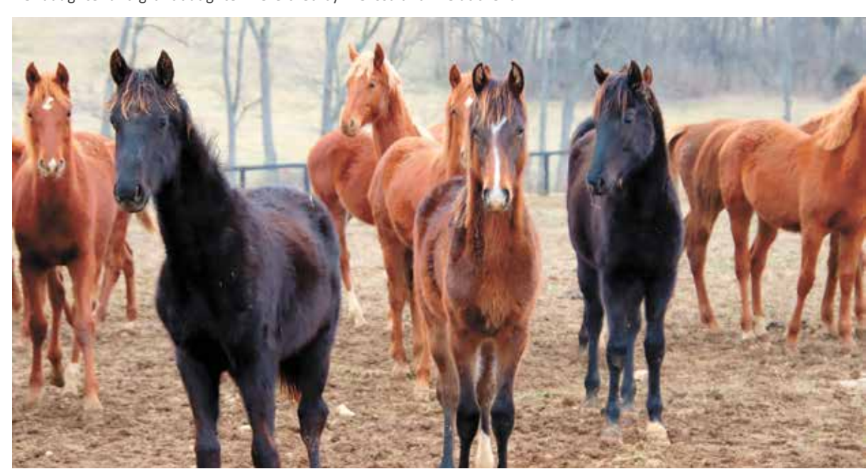
Part of the reward of being a breeder of Saddlebreds (or any breed for that matter) is to be able to see the promise in their eyes and know the anticipation of seeing them fulfill whatever their destinies might be. These yearlings represent a lot of time, love and hard work.