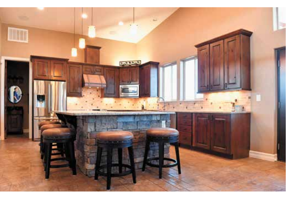
As indicated by the lounge inside the barn, Stacey is a self-described neat freak who likes everything a certain way.