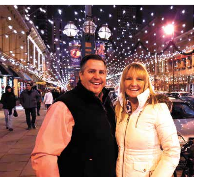
The Perrellis celebrate New Year's Eve in 2015.