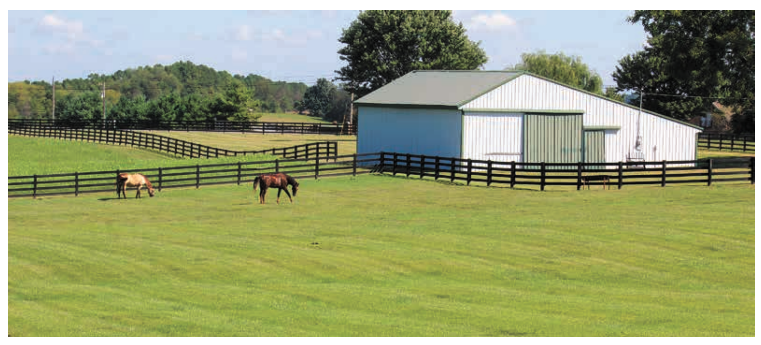
This is the view from many rooms on the front side of the house.

& 13-Year-Old Equitation titles to those she won with her gaited pony.