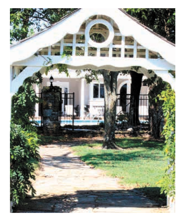
This gateway leads you from the barn to the back of the house where a magnificent pool and entertaining area await.

the phone number for the owner, I really need to talk to him.' She said, that really wasn't the procedure and stuff and I told her I wasn't trying to knock her out of a commission or anything but I needed to talk to him. She finally gave it to me and I called the guy. We had a few conversations and he had a couple of higher offers on the table but I explained what we wanted to do with the farm and it wasn't long before I had a call from the realtor and she said, "I can't believe it, but he's going to take your offer."