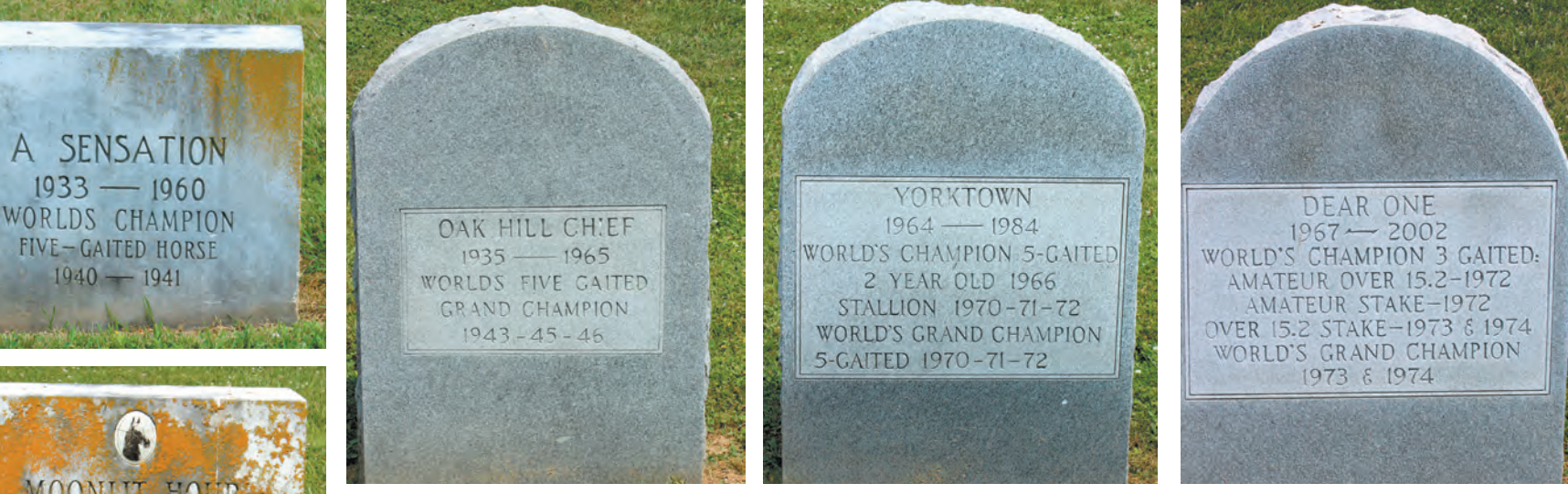
The graveyard on the property is a Who's Who of American Saddlebred greats. These are a few of the 20-some world's grand champions and world's champions buried there. Just this summer 1989 World's Grand Champion Three-Gaited CH Gimcrack joined the illustrious group of Oak Hill Farm stars honored with head stones.