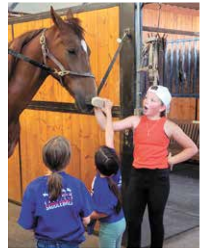
Young people enjoyed several different hands on experiences with the American Saddlebred.