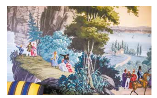
Beautiful murals are part of the décor of the 1815 home.