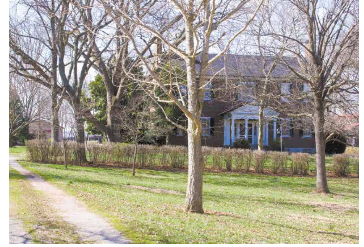
Among the many trees and shrubs sits the historic home with its great history and views from the