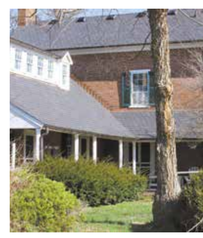
The back porch of the home takes you back to yesteryear.