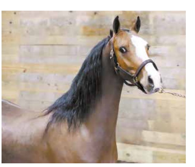
This three-year-old is showing great promise as a road pony

It's a formula that has worked for several years for the training duo. And given the new inspiration from their surroundings we can expect what we've come to know from the Hollow Haven team on the industry's biggest stages – champion American Saddlebreds and Hackneys year after year. The only difference being, now when they pull in the driveway after a week-long show, they will know they are truly home!