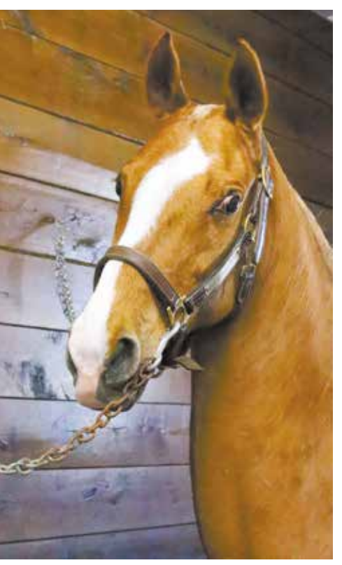
Many times world's champion of champions CH Our Brilliant Belle is still the gueen of