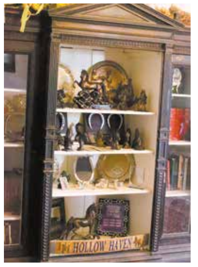
This impressive piece resides in the beautifully appointed office at the new Hollow Haven.