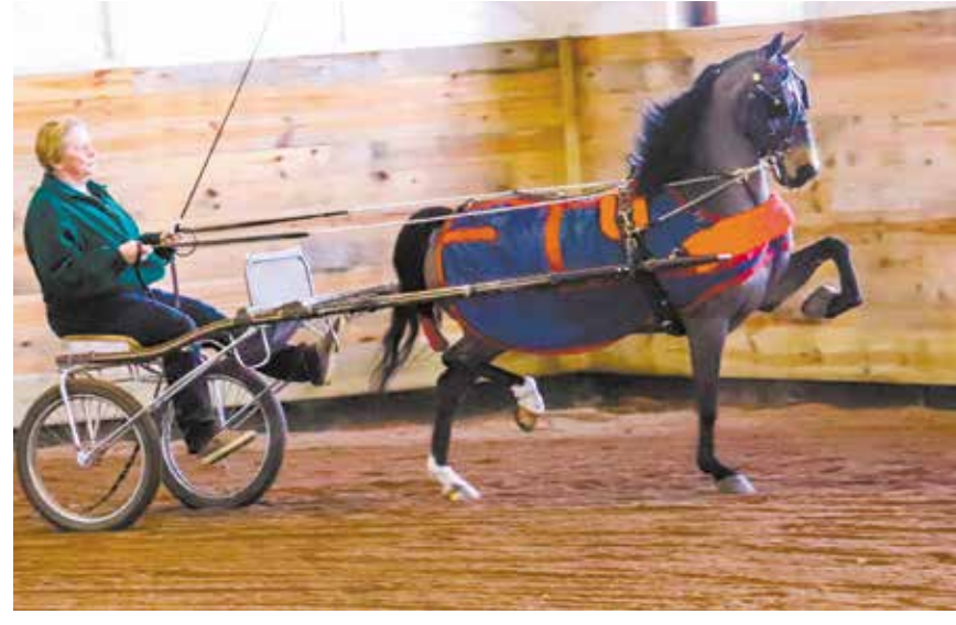
Heartland Hayday will make his presence known in the Hackney pleasure driving division

The peacefulness of it all is what makes this property so idyllic.