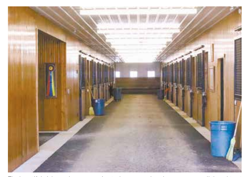
The beautiful aisles and accompanying tack rooms and work rooms were well thought out to be both efficient and lasting.