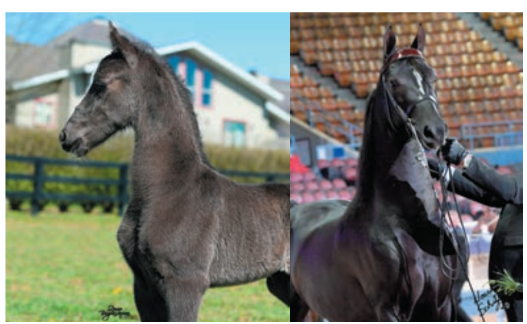
The Dragonsmeade stamp was clearly evident as a weanling in 2018 as well as in his world titled debut season in 2020 for Dragonsmeade Synergy.

"I think the maternal line is very important in our studs and in the dams too," she said. "That is paramount. I think that that's what draws us. My mother always loved the maternal line and I think that's transferred to us and in what we pick."