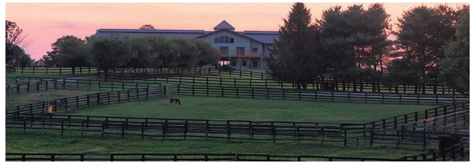
Winchester, Kentucky is home to Dragonsmeade Farm and the birthplace of countless champions bred by The People's Choice Breeder Of The Year.