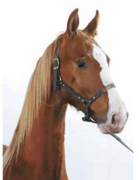
Chiefette is one of several bright prospects the Brisons are developing.