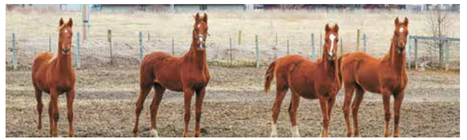
This curious group of yearlings are sired by (I-r) The Word Is Out, Fairview Marc My Words, Top Of The Mark and The Word Is Out.

On this Saturday morning visit several customers were out to tune up for the upcoming show season.