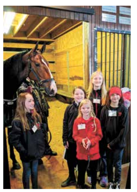
The Ingleside Farm attendees had a great time taking pictures and visiting with Bourbon Select back at his decorated stall.