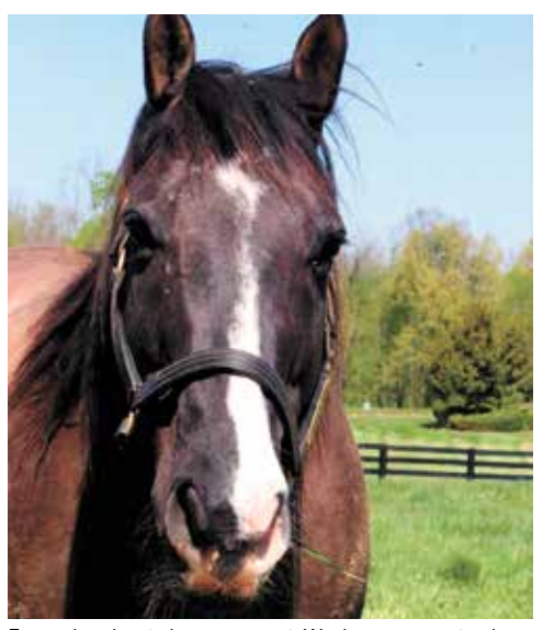
Every place has to have a mascot. Waylon serves not only as BellaVia's mascot but also as DiGiannantonio's trail horse.