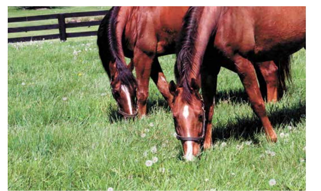
We Must Be Nuts and Military Secret munch on the lush grass while they are out for their morning exercise.