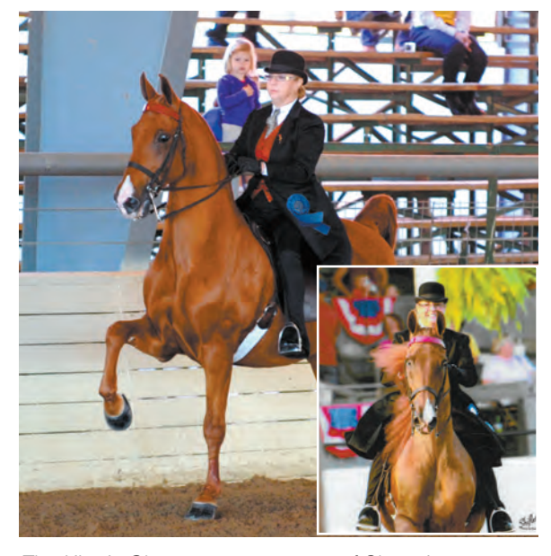
The King's Champagne was one of Sherry's most beloved horses, who she continued to show until he was 22 years old.