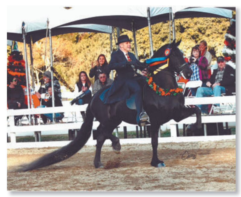
Always a star, two-time world champion Wodan romped down the rail for a welldeserved victory pass as the Friesian Saddle Seat Pleasure Champion at the Jingle Bell show.