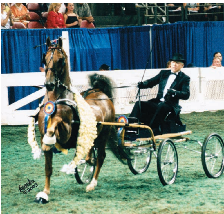
The personality of CH Callaway's Copyright came through in everything he did.

Life was a party for CH Callaway's Copyright and we were all lucky to be invited along. For his many fans he never let us down with incredible performance after incredible performance. For those who were actually a part of his family, there was never a bad day as long as the horse whose personality was three times bigger than his frame was nearby.