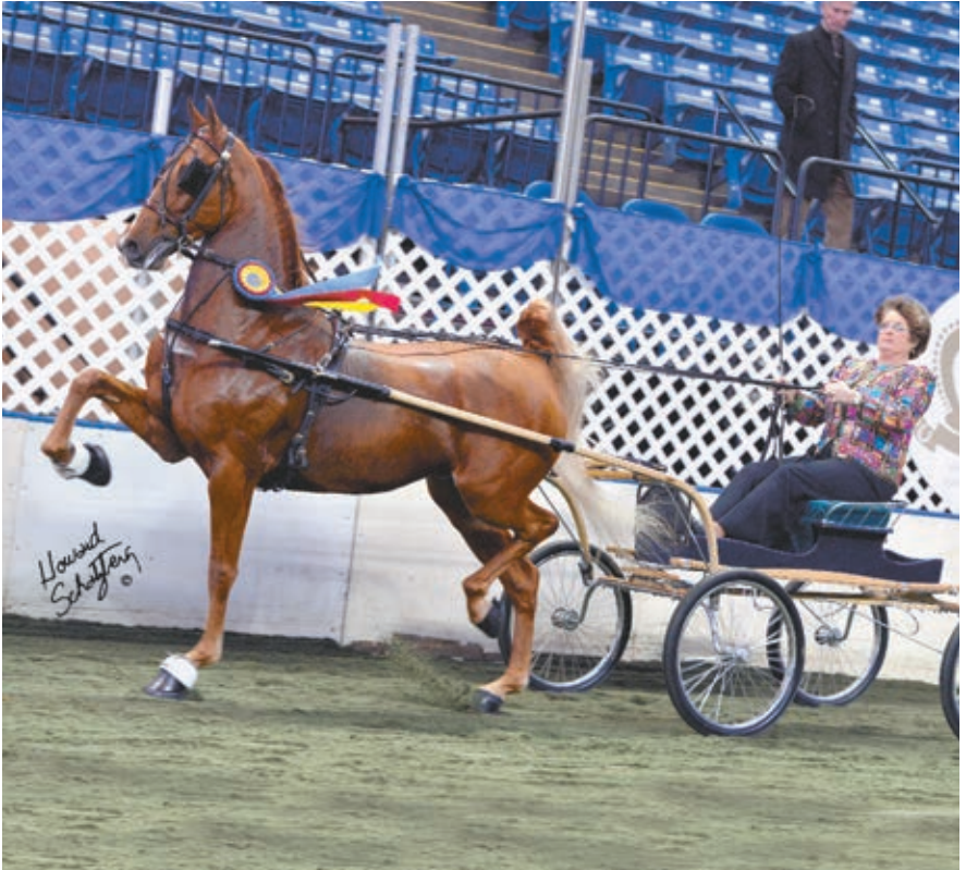
CH The Homecoming Queen stamped her offspring with a distinctive look. Half sisters A Magical Melody and Take Me Home Tonight both won UPHA Fine Harness Classic Championships.