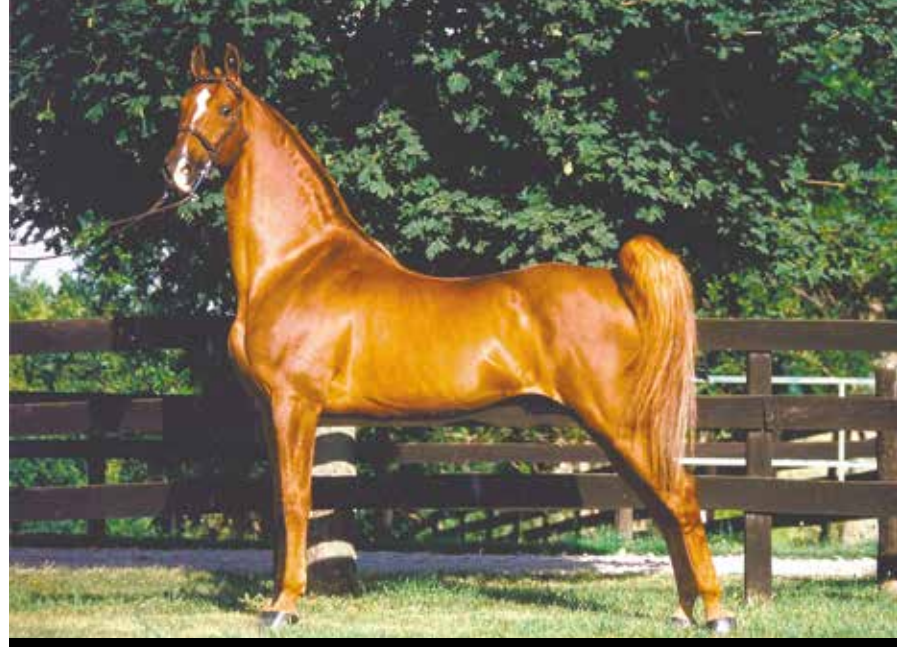
CH The Talk Of The Town represented Reedannland well in the breeding shed. Among others, he was the sire of Five-Gaited World's Grand Champion CH Breaking News.