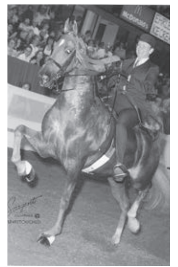
CH Will's Bulletin