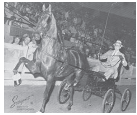
CH Beacon Hill