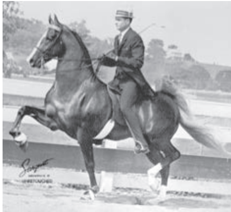
Chief Of Greystone