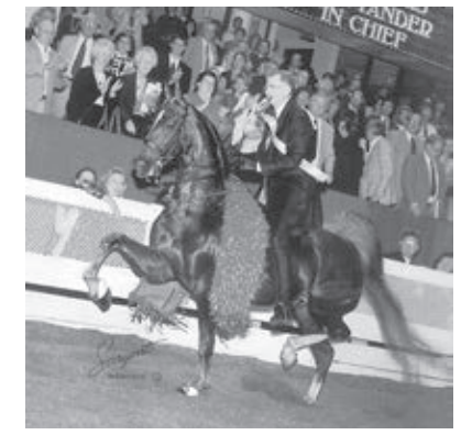
(SA) Zovoorbij Commander In Chief