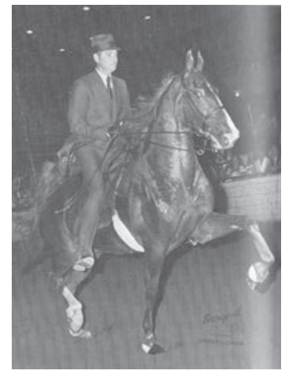
Burning Tree's Good Omen