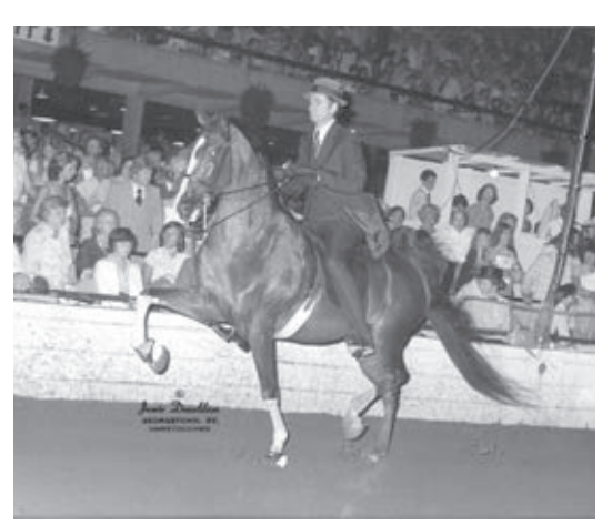
The Happy Hour