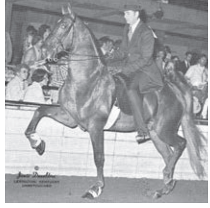
Burning Tree's Big Country