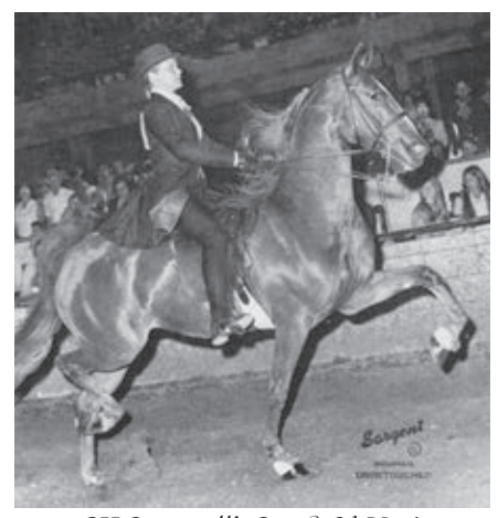
CH Stonewall's Sound Of Music