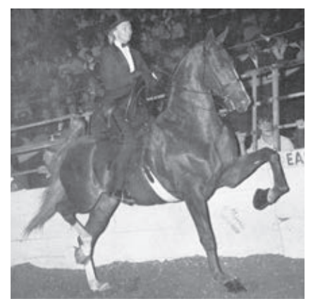
CH Gala Affair