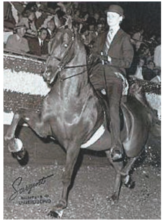
CH Summer Meloду