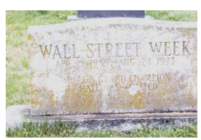
An equine graveyard on the property is a reminder of the great history of this farm.